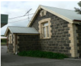
Lethbridge State School 2846 Midland Highway Lethbridge