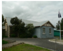
Lethbridge State School 2846 Midland Highway Lethbridge