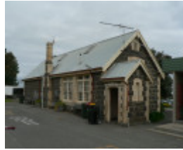
Lethbridge State School 2846 Midland Highway Lethbridge