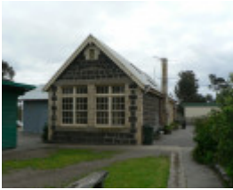
Lethbridge State School 2846 Midland Highway Lethbridge