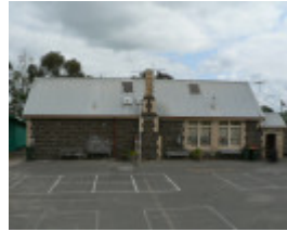
Lethbridge State School 2846 Midland Highway Lethbridge