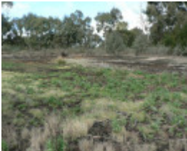
Former Teesdale Water Reserve