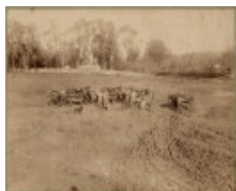
Chinamans Lagoon during construction 1878