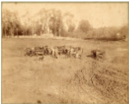
Chinamans Lagoon during construction 1878