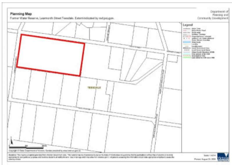
Extent of registration map