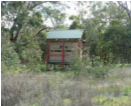
Former Teesdale Water Reserve