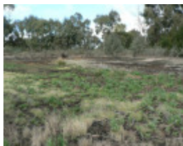
Former Teesdale Water Reserve