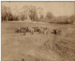
Chinamans Lagoon during construction 1878