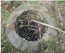
Former Teesdale Water Reserve