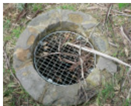
Former Teesdale Water Reserve