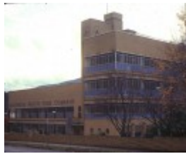
1 sanitarium health food company & signs front view jun1981