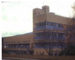
1 sanitarium health food company & signs front view jun1981