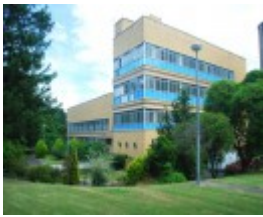
SANITARIUM HEALTH FOOD COMPANY AND SIGNS PUBLISHING COMPANY SOHE 2008