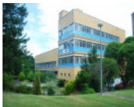
SANITARIUM HEALTH FOOD COMPANY AND SIGNS PUBLISHING COMPANY SOHE 2008