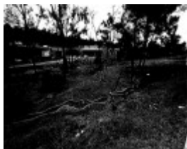
HO246 - curvilinear cascade water channels running through design.