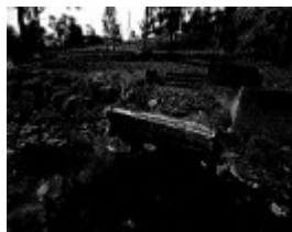
HO246 - Fayrefield Hat Factory, site of former foot bridge over creek