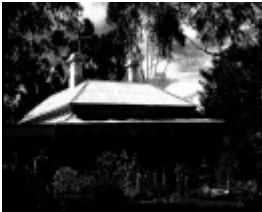
HO244 - Wadeson house