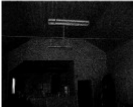
HO239 - Library entry