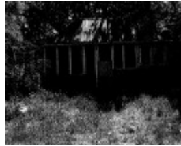
HO238 - Front of house from south, verandah enclosed