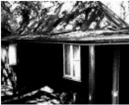
HO238 - Rear (north) elevation, showing vertical slabs