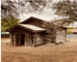
Warrack Lock-up April 2023 1