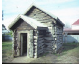
1 lock up devereux street warracknabeal front elevation jul1984