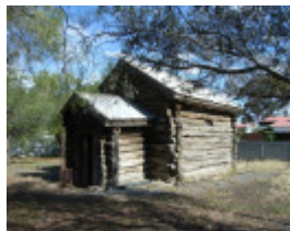
LOCK-UP SOHE 2008