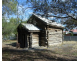
LOCK-UP SOHE 2008