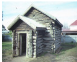
1 lock up devereux street warracknabeal front elevation jul1984