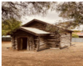
Warrack Lock-up April 2023 1