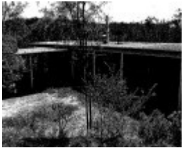
HO224 - Arnold house, carport and house - view from south (rear)