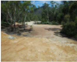
CASSILIS GOLD MINING COMPANY TREATMENT WORKS SOHE 2008