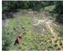
CASSILIS GOLD MINING COMPANY TREATMENT WORKS SOHE 2008