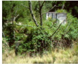
1 cassilis gold treatment works substation db