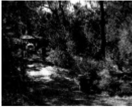
HO222 - House (gable) viewed from east, with added carport at front