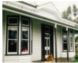
Edendale farm Colour 1