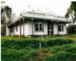
Edendale farm Colour 5