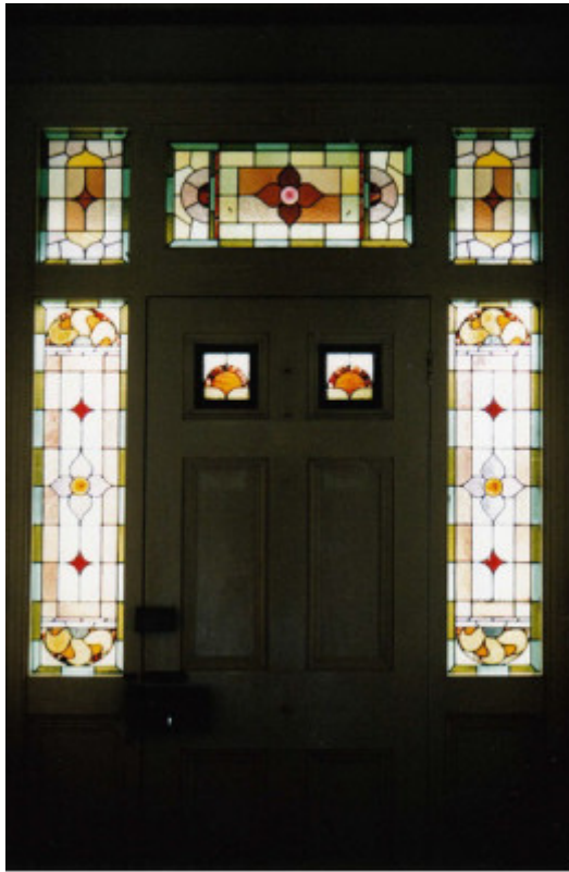
HO204 - Edendale - Eltham Pound Keepers Residence leadlighting.jpg