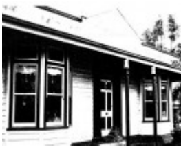
Edendale Farm House