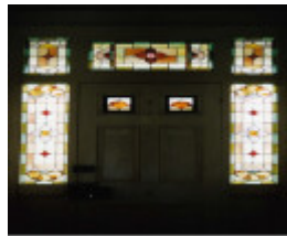
HO204 - Edendale - Eltham Pound Keepers Residence leadlighting.jpg