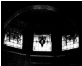
Edendale Farm House