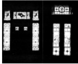
Edendale Farm House