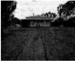
Edendale farm house from south, showing basalt garden edges and trachycarpus specimens