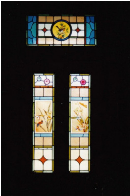
HO204 - Edendale - Eltham Pound Keepers Residence leadlighting 2.jpg