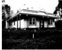
Edendale Farm House