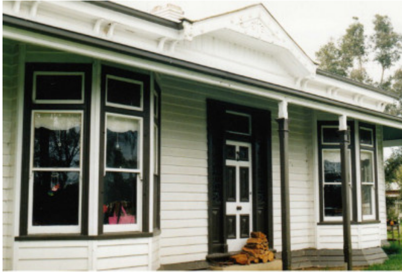
HO204 - Edendale - Eltham Pound Keepers Residence 2.jpg