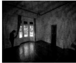
one of the main receiving rooms of the house