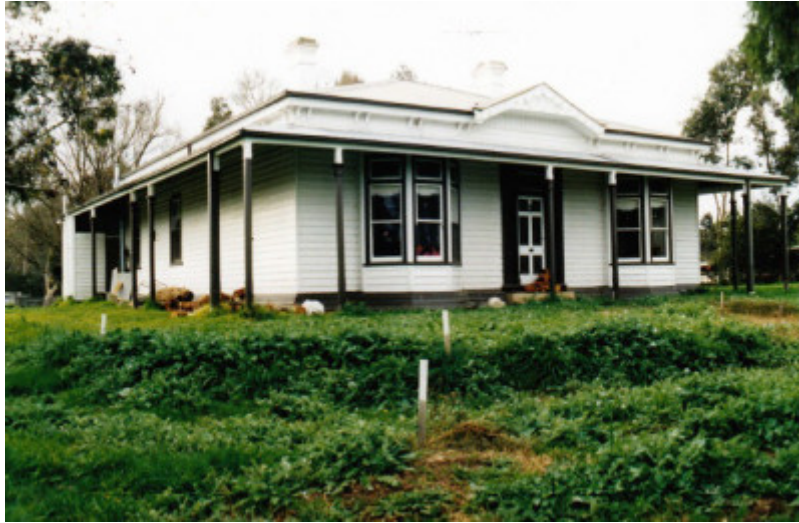
HO204 - Edendale - Eltham Pound Keepers Residence.jpg