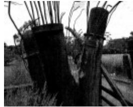
part of sculpture, with Roman numeral notation