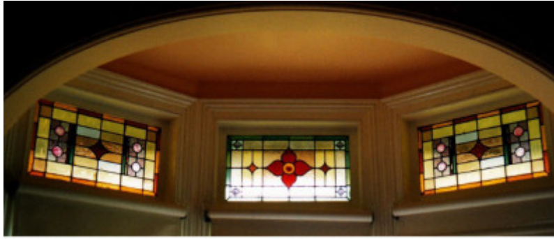
HO204 - Edendale - Eltham Pound Keepers Residence leadlighting 3.jpg