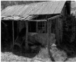
HO200 - Hill, later Birch farm complex - cottage from street