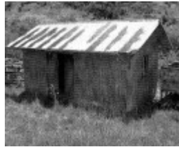
HO200 - Hill, later Birch farm complex - Standard design diary erected in 1935