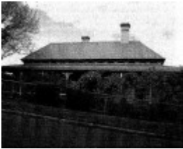
Windermere, former Leach residence