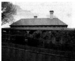
Windermere, former Leach residence