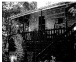
Former Christmas Hills Post Office Store - entry to the residence