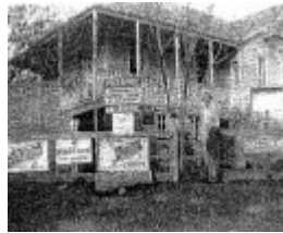
Former Christmas Hills Post Office Store - Photograph of the building, 1947