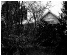
Former Christmas Hills Post Office Store - Gable and box window of 1915 Section