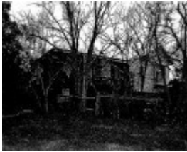
Former Christmas Hills Post Office Store