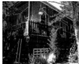
Former Christmas Hills Post Office Store - Relocated 1870's section of the residence