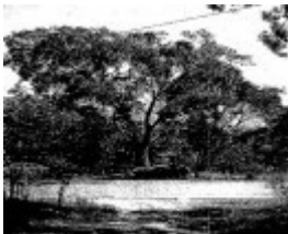
The Gossip free across the road