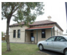
POLICE STATION COMPLEX SOHE 2008