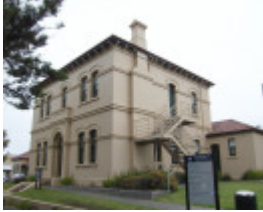
POLICE STATION COMPLEX SOHE 2008