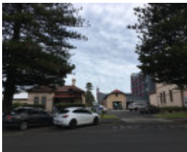
Police residence and stables