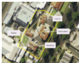
Former Police Station Complex aerial diagram