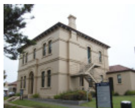
POLICE STATION COMPLEX SOHE 2008