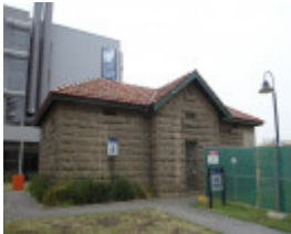
POLICE STATION COMPLEX SOHE 2008