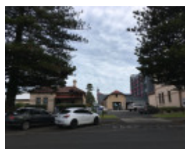
Police residence and stables