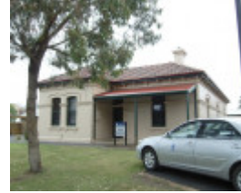
POLICE STATION COMPLEX SOHE 2008