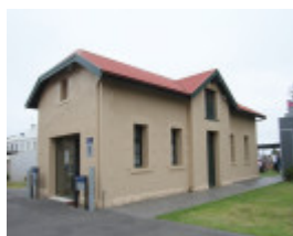
POLICE STATION COMPLEX SOHE 2008