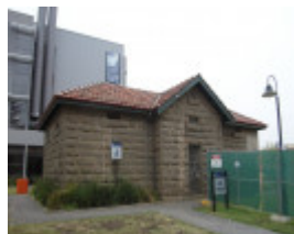
POLICE STATION COMPLEX SOHE 2008