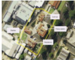
Former Police Station Complex aerial diagram