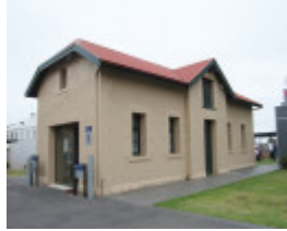
POLICE STATION COMPLEX SOHE 2008