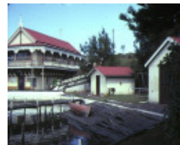
1 proudfoot's boathouse simpson street warrnambool view of property mar1985