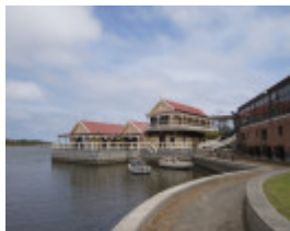
PROUDFOOT'S BOATHOUSE SOHE 2008