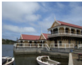
PROUDFOOT'S BOATHOUSE SOHE 2008