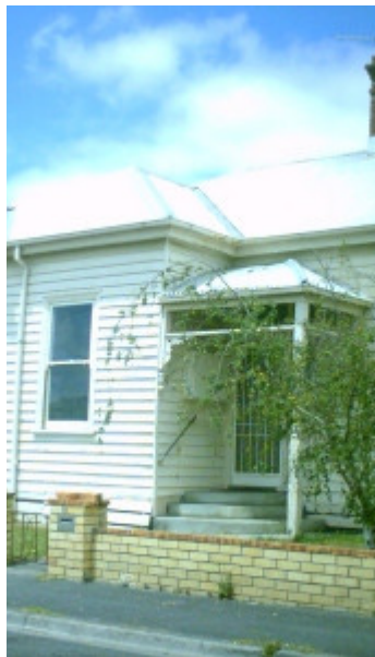
11 Pizer Street, Geelong West