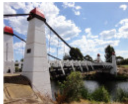
Before Photographs - Reference F3855 2014