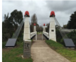
After Photograph - Reference F3855 2016