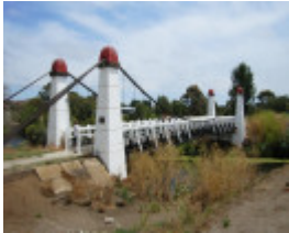
WOLLASTON BRIDGE SOHE 2008