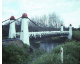
1 bridge over merri river warrnambool side view may1984