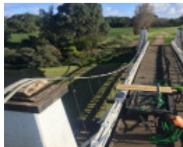
During Photograph - Reference F3855 2014