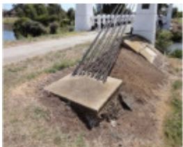
Before Photographs - Reference F3855 2014