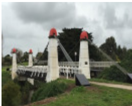
After Photograph - Reference F3855 2016