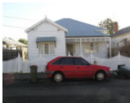
50 Preston Street, Geelong West