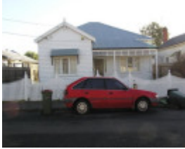
50 Preston Street, Geelong West