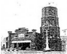
East Ballarat Fire Station - Ballarat Heritage Review, 1998