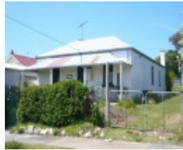
Stavely, 1 Henry Street, Queenscliff