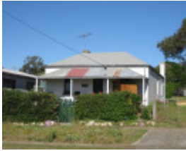
Stavely, 1 Henry Street, Queenscliff