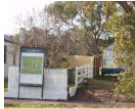
Stavely, 1 Henry Street, Queenscliff