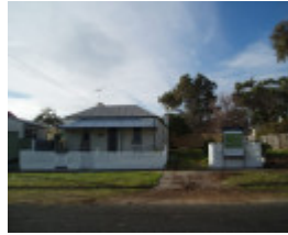
Stavely, 1 Henry Street, Queenscliff