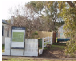
Stavely, 1 Henry Street, Queenscliff