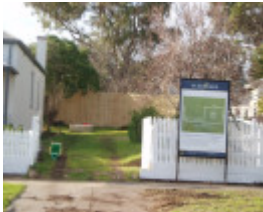
Stavely, 1 Henry Street, Queenscliff