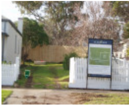
Stavely, 1 Henry Street, Queenscliff