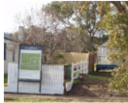
Stavely, 1 Henry Street, Queenscliff