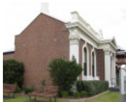
Free Public Library, 55 Hesse Street, Queenscliff