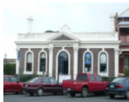
Free Public Library, 55 Hesse Street, Queenscliff