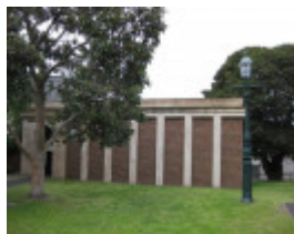
Free Public Library, 55 Hesse Street, Queenscliff