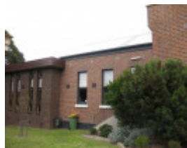
Free Public Library, 55 Hesse Street, Queenscliff