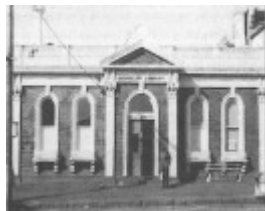
Free Public Library, 55 Hesse Street