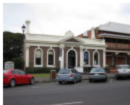
Free Public Library, 55 Hesse Street, Queenscliff