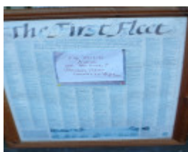
Doongara, 62 Hesse Street (37 Learmonth Street), Queenscliff