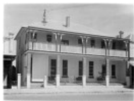
SLV c1950 Doongara, 62 Hesse Street (37 Learmonth Street), Queenscliff