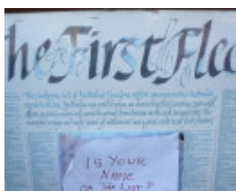
Doongara, 62 Hesse Street (37 Learmonth Street), Queenscliff