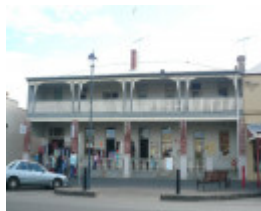
Doongara, 62 Hesse Street (37 Learmonth Street), Queenscliff