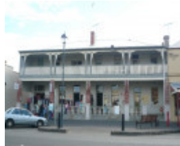
Doongara, 62 Hesse Street (37 Learmonth Street), Queenscliff