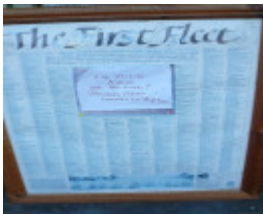
Doongara, 62 Hesse Street (37 Learmonth Street), Queenscliff