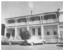
Doongara, 62 Hesse Street