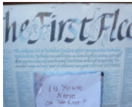
Doongara, 62 Hesse Street (37 Learmonth Street), Queenscliff