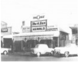
72 Hesse Street, Queenscliff