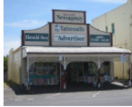
72 Hesse Street, Queenscliff