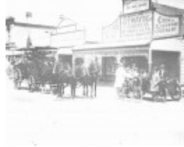
72 and 74 Hesse Street c.1905.