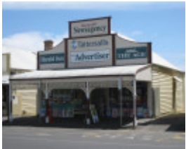
72 Hesse Street, Queenscliff