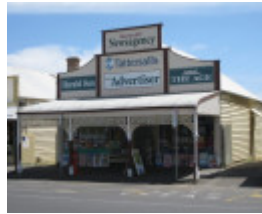
Former Bank of Victoria, 76 Hesse Street, Queenscliff