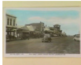
Former Bank of Victoria, 76 Hesse Street, Queenscliff