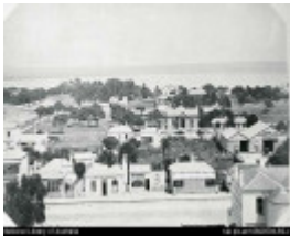
NLA c1880 _ former Bank of Victoria, 76 Hesse Street, Queenscliff