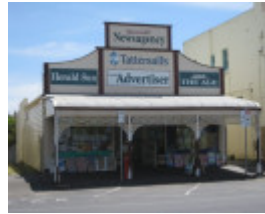
Former Bank of Victoria, 76 Hesse Street, Queenscliff