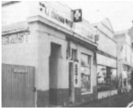
Former Bank of Victoria, 76 Hesse Street, Queenscliff