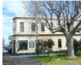
Seaview Guest house, 86 Hesse Street, Queenscliff