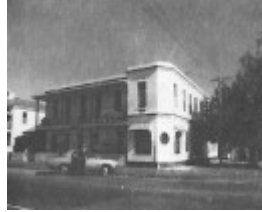
SeaView Guest House, 1981