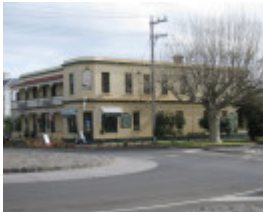
Seaview Guest house, 86 Hesse Street, Queenscliff