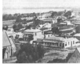
Seaview Guest House, c.1880.