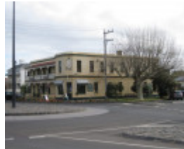
Seaview Guest house, 86 Hesse Street, Queenscliff