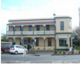
Seaview Guest house, 86 Hesse Street, Queenscliff