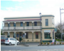
Seaview Guest house, 86 Hesse Street, Queenscliff