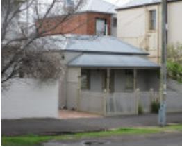
88 Hesse Street. Queenscliff