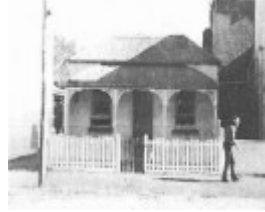
88 Hesse Street. Queenscliff