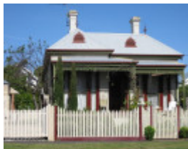
Kelvinargh, 93 Hesse Street, Queenscliff