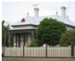
Kelvinargh, 93 Hesse Street, Queenscliff