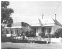
Kelvinargh, 93 Hesse Street, Queenscliff