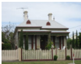
Kelvinargh, 93 Hesse Street, Queenscliff