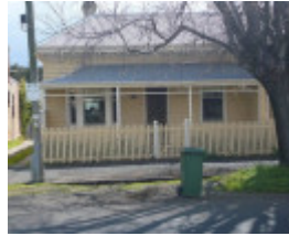
Warley Cottage, 94 Hesse Street and Shenfield, 96 Hesse Street, Queenscliff