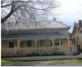
Warley Cottage, 94 Hesse Street and Shenfield, 96 Hesse Street, Queenscliff