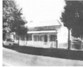
Warley and Shenfield Cottages.