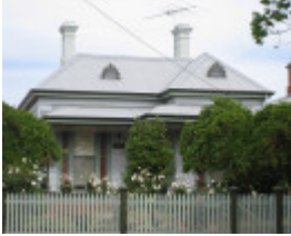
Carnbrea, 95 Hesse Street, Queenscliff