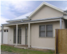
rear of 95 Hesse Street, Queenscliff