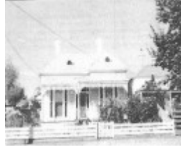
Carnbrea, 95 Hesse Street, Queenscliff