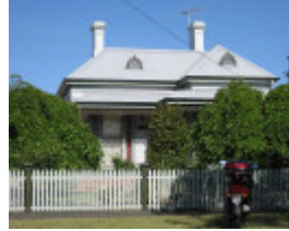
Carnbrea, 95 Hesse Street, Queenscliff