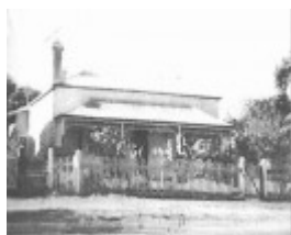
Navestock, 107 Hesse Street, Queenscliff