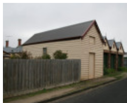
Rear of 107 Hesse Street Poss Ind HO