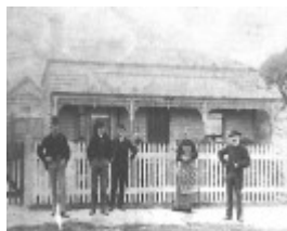
Navestock, undated