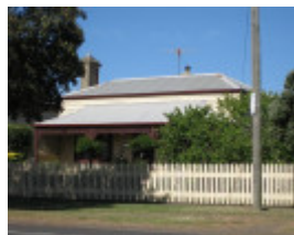
Navestock, 107 Hesse Street, Queenscliff