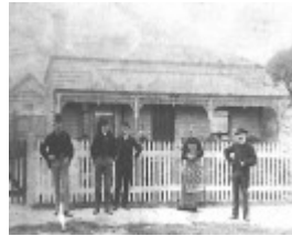
Navestock, undated