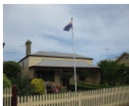
Navestock, 107 Hesse Street, Queenscliff