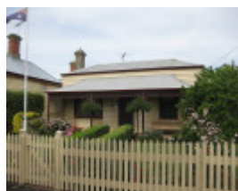
Navestock, 107 Hesse Street, Queenscliff