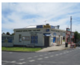
43 King Street, Queenscliff