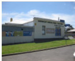
43 King Street, Queenscliff