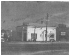
43 King Street, Queenscliff