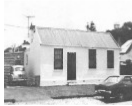
Nippy-Ville, 26 Learmonth Street, Queenscliff