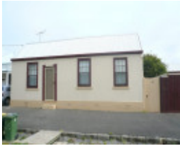
Nippy-Ville, 26 Learmonth Street, Queenscliff