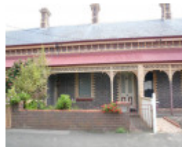
Thanet Terrace, (formerly Thanet Cottages), 34-44 Learmonth Street Queenscliff