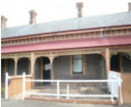
Thanet Terrace, (formerly Thanet Cottages), 34-44 Learmonth Street Queenscliff