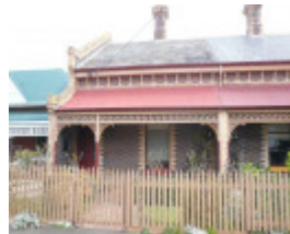
Thanet Terrace, (formerly Thanet Cottages), 34-44 Learmonth Street Queenscliff