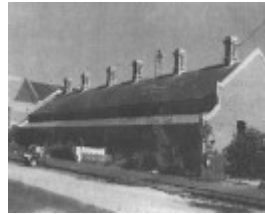
Thanet Terrace, (formerly Thanet Cottages), 36-46 Learmonth Street, Queenscliff