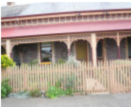
Thanet Terrace, (formerly Thanet Cottages), 34-44 Learmonth Street Queenscliff