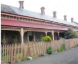
Thanet Terrace, (formerly Thanet Cottages), 34-44 Learmonth Street Queenscliff