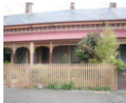
Thanet Terrace, (formerly Thanet Cottages), 34-44 Learmonth Street Queenscliff