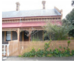
Thanet Terrace, (formerly Thanet Cottages), 34-44 Learmonth Street Queenscliff