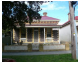
Lindores, (No. 41 Learmonth Street)