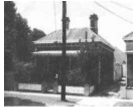
41-43 Learmonth Street, Queenscliff