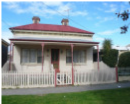
Lindores, 43 Learmonth Street (unnamed), Queenscliff