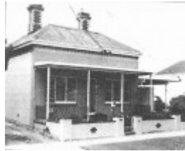
41-43 Learmonth Street, Queenscliff