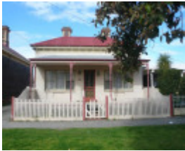
Lindores, 43 Learmonth Street (unnamed), Queenscliff