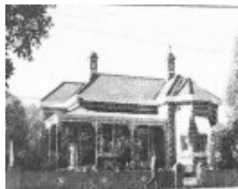
59 Learmonth Street, Queenscliff