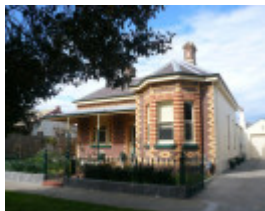
Wyndom, 59 Learmonth Street, Queenscliff