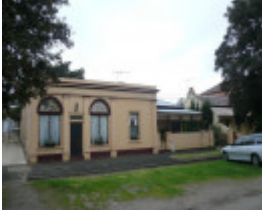
66 Learmonth Street, Queenscliff