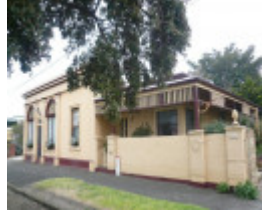
66 Learmonth Street, Queenscliff