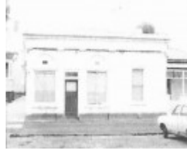
66 Learmonth Street, Queenscliff