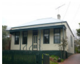
Former Barkly Inn, 72 Learmonth Street, Queenscliff