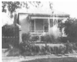
72 Learmonth Street, Queenscliff