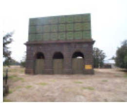
H01416 water tank werribee feb2003