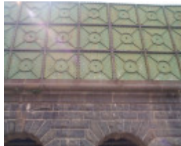
H01416 water tank werribee3 feb2003