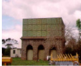
H01416 water tank werribee front view ab oct97