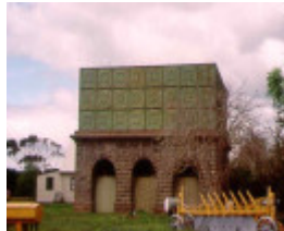
H01416 water tank werribee front view ab oct97