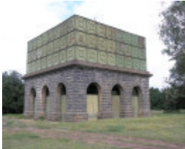
WATER TANK SOHE 2008