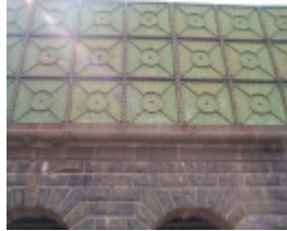
H01416 water tank werribee3 feb2003