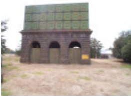
H01416 water tank werribee2 feb2003