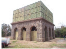
H01416 1 water tank werribee4 feb2003