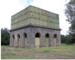
WATER TANK SOHE 2008