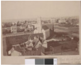
St Peters with water tank in background 1866.JPG