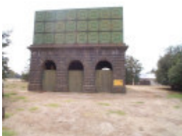
H01416 water tank werribee2 feb2003