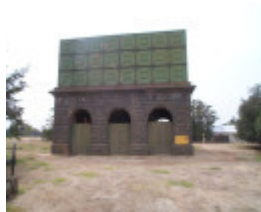
H01416 water tank werribee feb2003