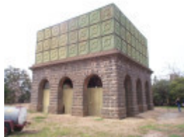
H01416 1 water tank werribee4 feb2003