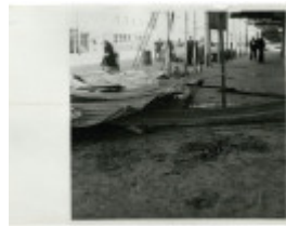
Mining Exchange_Streetscape