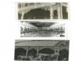
Mining Exchange_1_c1901