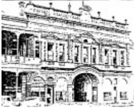
Mining Exchange - Film 1 / Frame 22 - Ballarat Conservation Study, 1978