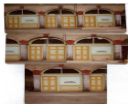
Mining Exchange_4