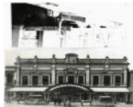
Mining Exchange_Streetscape_5