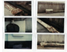
Mining Exchange_Iron works_2