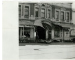
Mining Exchange_Streetscape_1