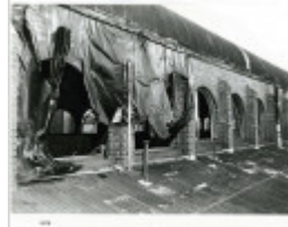
Mining Exchange_Roof_1976