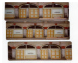
Mining Exchange_3