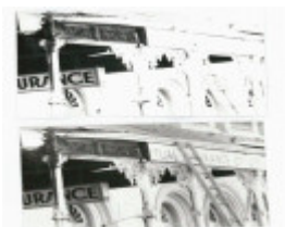
Mining Exchange_Streetscape_6