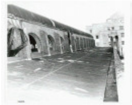
Mining Exchange_Roof_2_1976