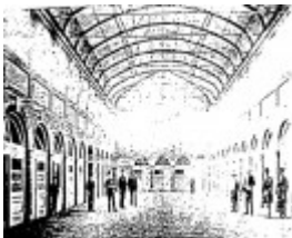
Mining Exchange04 - Mining Exchange interior shortly after opening (the date '1887' has been written on the original photo; obviously erroneous) This view clearly show the layout of the booths and their original joinery - Ballarat Conservation Study, 1978