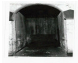
Mining Exchange_1976