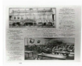
Mining Exchange_Evening Echo_1904