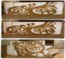
Mining Exchange_Iron works_1