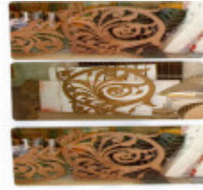
Mining Exchange_Iron works