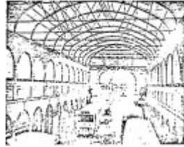
Mining Exchange02 - Ballarat Conservation Study, 1978