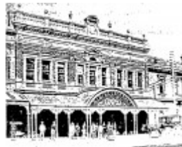
Mining Exchange05 - Lydiard Street elevation c.1900. Apart from the clear view of the verandah, the photo also shows the single storey verandah of the Old Colonist's Hall to the north - Ballarat Conservation Study, 1978