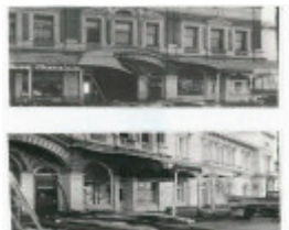
Mining Exchange_Streetscape_3