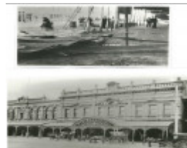
Mining Exchange_Streetscape_4