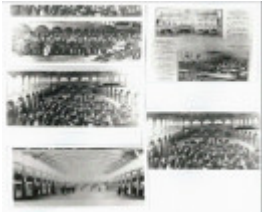
Mining Exchange_5