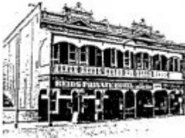
Reids Coffee Palace - Film 6 / Frame 35 - Ballarat Conservation Study, 1978