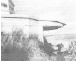
A light emplacement below Lonsdale Lighthouse