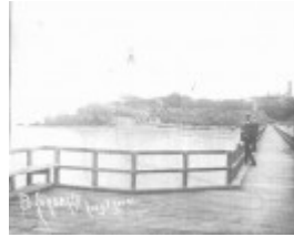
The second lighthouse (1901-02) and the old timber lighthouse from Shortlands Bluff from the Point Lonsdale Pier c.1910.