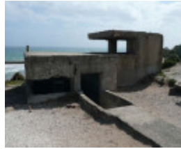
Military emplacement, c. 1930s/40s