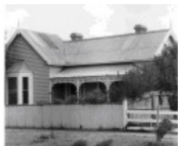
'Warraine', 50 Gellibrand Street, March 1983 Source: SLV (jc014122)