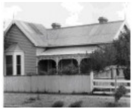
'Warraine', 50 Gellibrand Street, March 1983