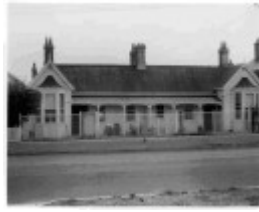
Pilots Row, 60-62, Gellibrand Street c1983-1986