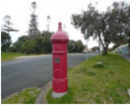
View south along Gellibrand Street from the corner with Stokes Street.