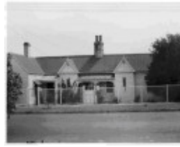
Pilots Row, 66-68 Gellibrand Street c. 1983-1986