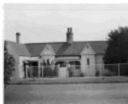
Pilots Row, 66-68 Gellibrand Street c. 1983-1986