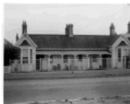
Pilots Row, 60-62, Gellibrand Street c1983-1986