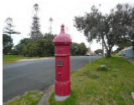
View south along Gellibrand Street from the corner with Stokes Street.