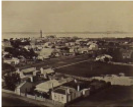
View south east from St Georges Tower, Queenscliff c. 1880-1900.