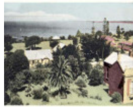
Queenscliff General View c. 1950 looking across the former Custom Reserve.