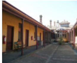
ST ALBANS HOMESTEAD SOHE 2008