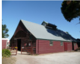
ST ALBANS HOMESTEAD SOHE 2008