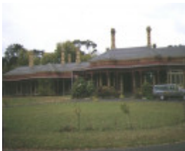
1 st albans homestead whittington front view apr1997