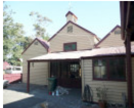
ST ALBANS HOMESTEAD SOHE 2008