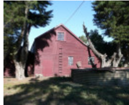
ST ALBANS HOMESTEAD SOHE 2008