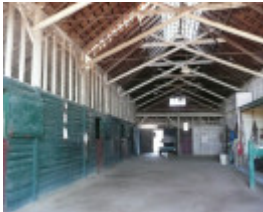
ST ALBANS HOMESTEAD SOHE 2008