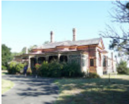
ST ALBANS HOMESTEAD SOHE 2008