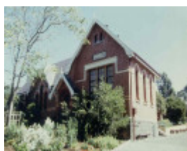
1 primary school no 2090 plenty road whittlesea front view