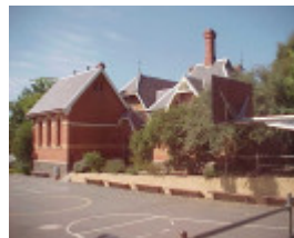
h01717 whittlesea primary school no 2090 plenty road whittlesea playground she project 2004