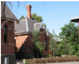
WHITTLESEA PRIMARY SCHOOL NO. 2090 SOHE 2008