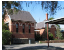
WHITTLESEA PRIMARY SCHOOL NO. 2090 SOHE 2008