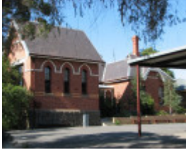
WHITTLESEA PRIMARY SCHOOL NO. 2090 SOHE 2008