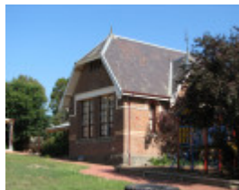
WHITTLESEA PRIMARY SCHOOL NO. 2090 SOHE 2008