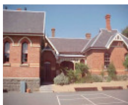
h01717 whittlesea primary school no 2090 plenty road whittlesea close up she project 2004