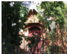
WHITTLESEA PRIMARY SCHOOL NO. 2090 SOHE 2008