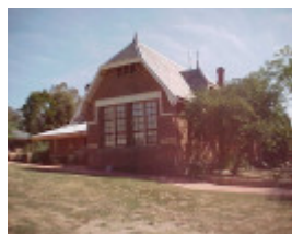
h01717 whittlesea primary school no 2090 plenty road whittlesea exterior she project 2004