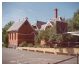
h01717 whittlesea primary school no 2090 plenty road whittlesea playground she project 2004