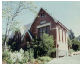
1 primary school no 2090 plenty road whittlesea front view