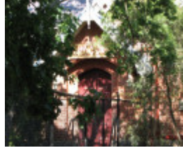
WHITTLESEA PRIMARY SCHOOL NO. 2090 SOHE 2008