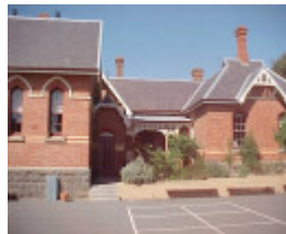
h01717 whittlesea primary school no 2090 plenty road whittlesea close up she project 2004