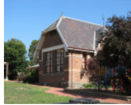
WHITTLESEA PRIMARY SCHOOL NO. 2090 SOHE 2008