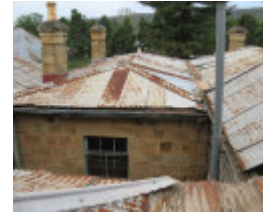
121693_former survey office_Helenslee_Heathcote_April_2010 (1).jpg