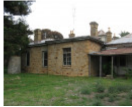
121693_former survey office_Helenslee_Heathcote_April_2010 (1).jpg