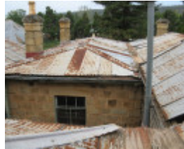
121693_former survey office_Helenslee_Heathcote_A (1).jpg