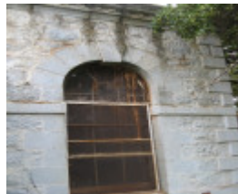
121693_former survey office_Helenslee_Heathcote_April_2010 (1).jpg