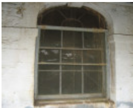
121693_former survey office_Helenslee_Heathcote_April_2010 (1).jpg