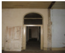
121693_former survey office_Helenslee_Heathcote_April_2010 (1).jpg