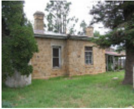
121693_former survey office_Helenslee_Heathcote_April_2010 (10).jpg