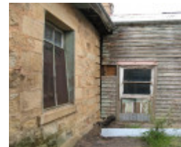
121693_former survey office_Helenslee_Heathcote_April_2010 (1).jpg