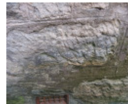
121693_former survey office_Helenslee_Heathcote_April_2010 (1).jpg