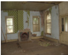
121693_former survey office_Helenslee_Heathcote_April_2010 (1).jpg