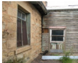
121693_former survey office_Helenslee_Heathcote_A (1).jpg