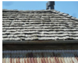
H0560 ST HELLIERS LHA 2015 3.JPG