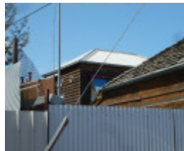
H0560 ST HELLIERS LHA 2015 4.JPG