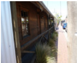
H0560 ST HELLIERS LHA 2015 2.JPG