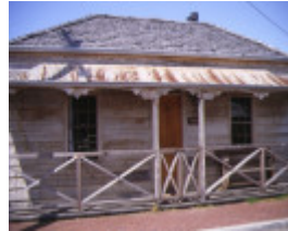
1 st helliers coxs garden williamstown detail front facade