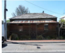
H0560 ST HELLIERS LHA 2015 1.JPG