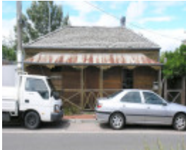
ST HELLIERS SOHE 2008