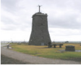
TIME BALL TOWER SOHE 2008