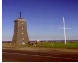
1 time ball tower point gellibrand williamstown june1999